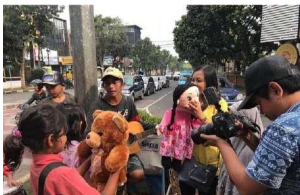
Figure 2. Filming process of the @menjemputberkahtrans7 team with the @sedekahmainan community

Optimism was also a strong component of positive affect in the subjects. The belief that good intentions will bring multiple benefits reflects a religious and positive coping strategy. This optimistic attitude allows the subjects to remain calm in the face of problems because they believe in God's better solutions and plans. Based on theory, optimism is closely related to an increase in SWB because it helps individuals manage stress and maintain hope for the future (Devitasari & Utami, 2022).