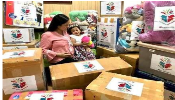
Figure 1. Subject and the Toy donations

Beyond being a mission, this movement is a form of deep passion. The subject feels an integration between their personal identity and the act of giving. Past experiences filled with despair and feelings of helplessness were overcome when the subject found meaning in being useful to others. The subject's consistency in not feeling boredom despite being busy indicates the presence of harmonious passion.